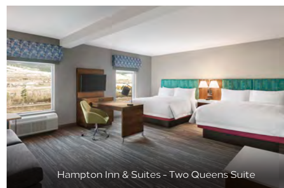
Hampton Inn & Suites - Two Queens Suite