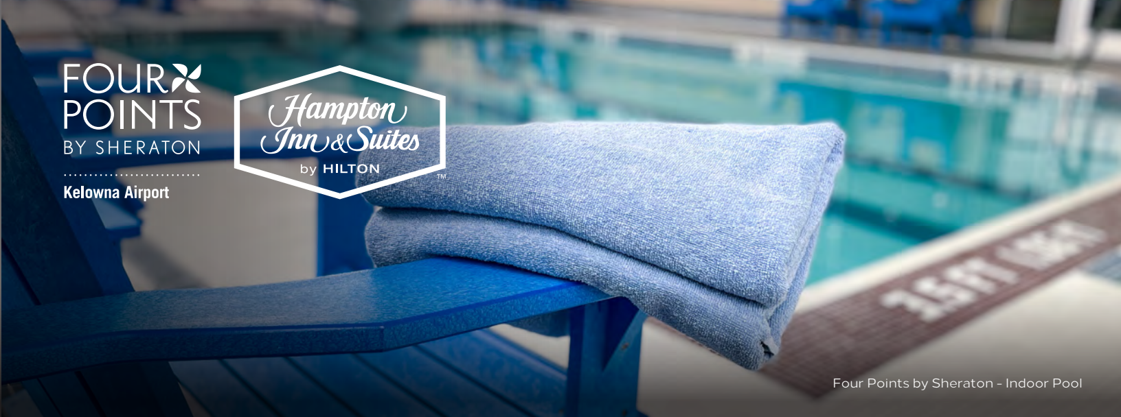
Four Points by Sheraton - Indoor Pool