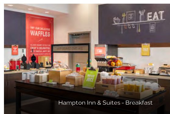
Hampton Inn & Suites - Breakfast